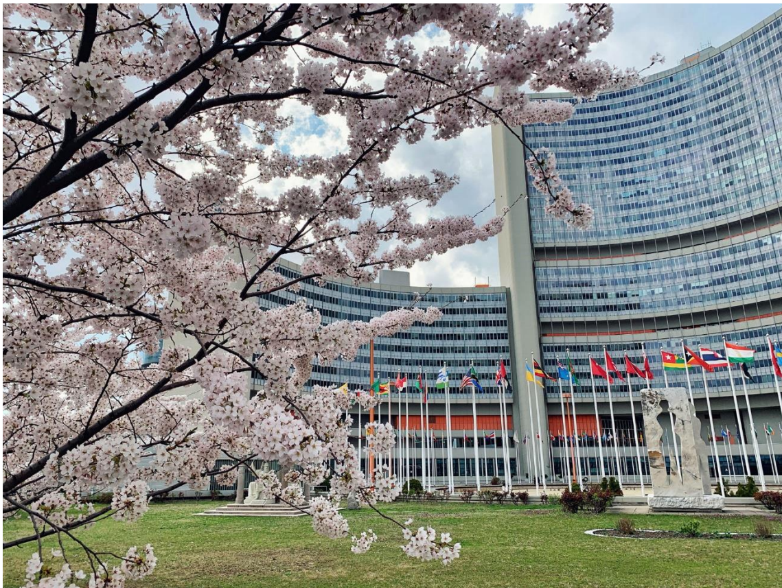
United Nations Office at Vienna (UNOV) Vienna International Centre Wagramer Str. 5, Vienna, Austria

The Vienna International Centre (VIC) or 'UNO City' is located on the banks of the River Danube, only a 10-minute ride by underground (U-Bahn) to the city centre. The VIC comprises several buildings, labelled A to M. The 58 th session of UNCITRAL (7–23 July 2025) will be held in the Conference Area (C Building) in BR-D on the 4th floor from 9.30 a.m. to 12.30 p.m. and from 2 p.m. to 5 p.m., except on Monday, 7 July 2025, when the morning meeting will commence at 10 a.m.