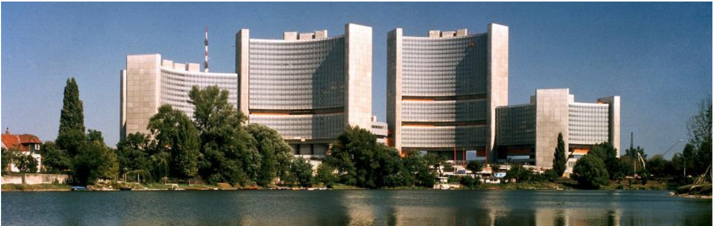
Vienna International Centre