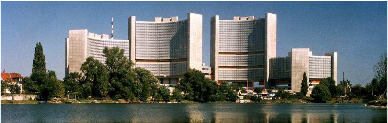
Vienna International Center